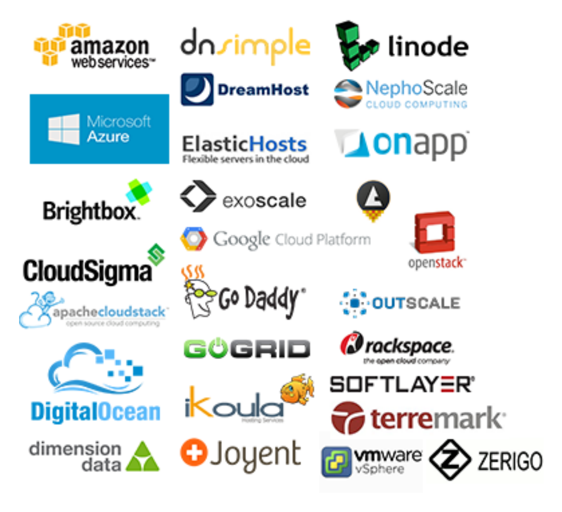
Fig. 1: A subset of supported providers in Libcloud.