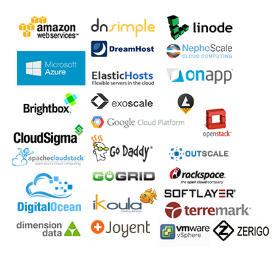
Fig. 1: A subset of supported providers in Libcloud.