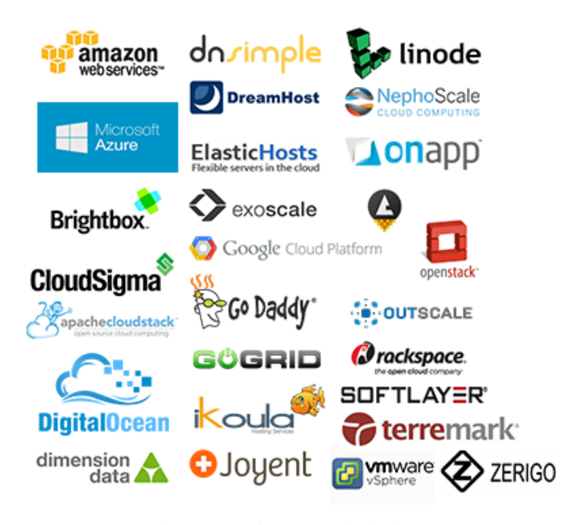
Fig. 1: A subset of supported providers in Libcloud.