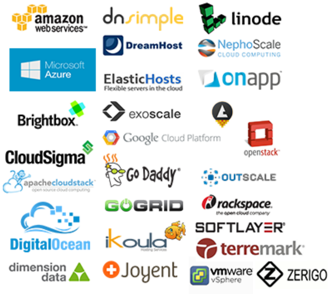
Fig. 1: A subset of supported providers in Libcloud.