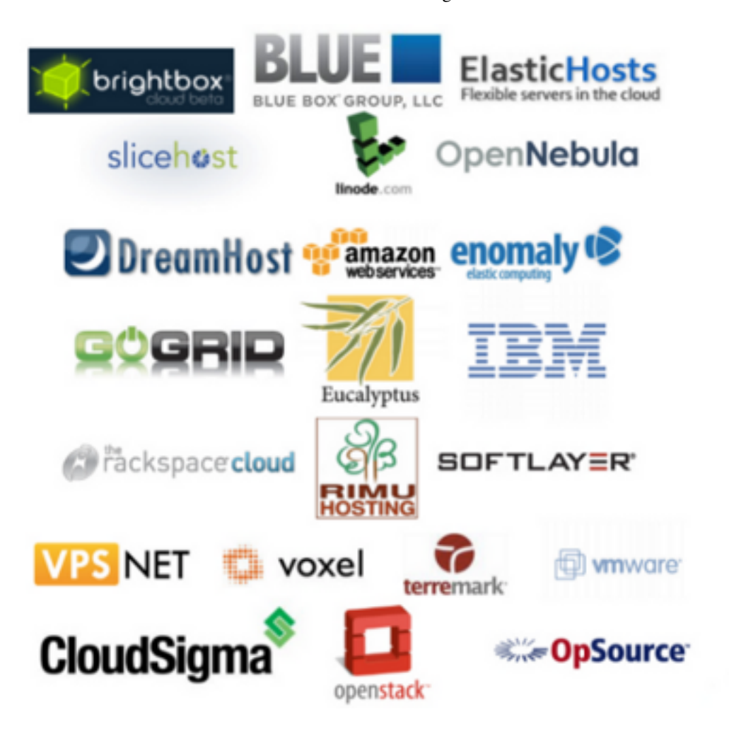
Fig. 1: A subset of supported providers in Libcloud.