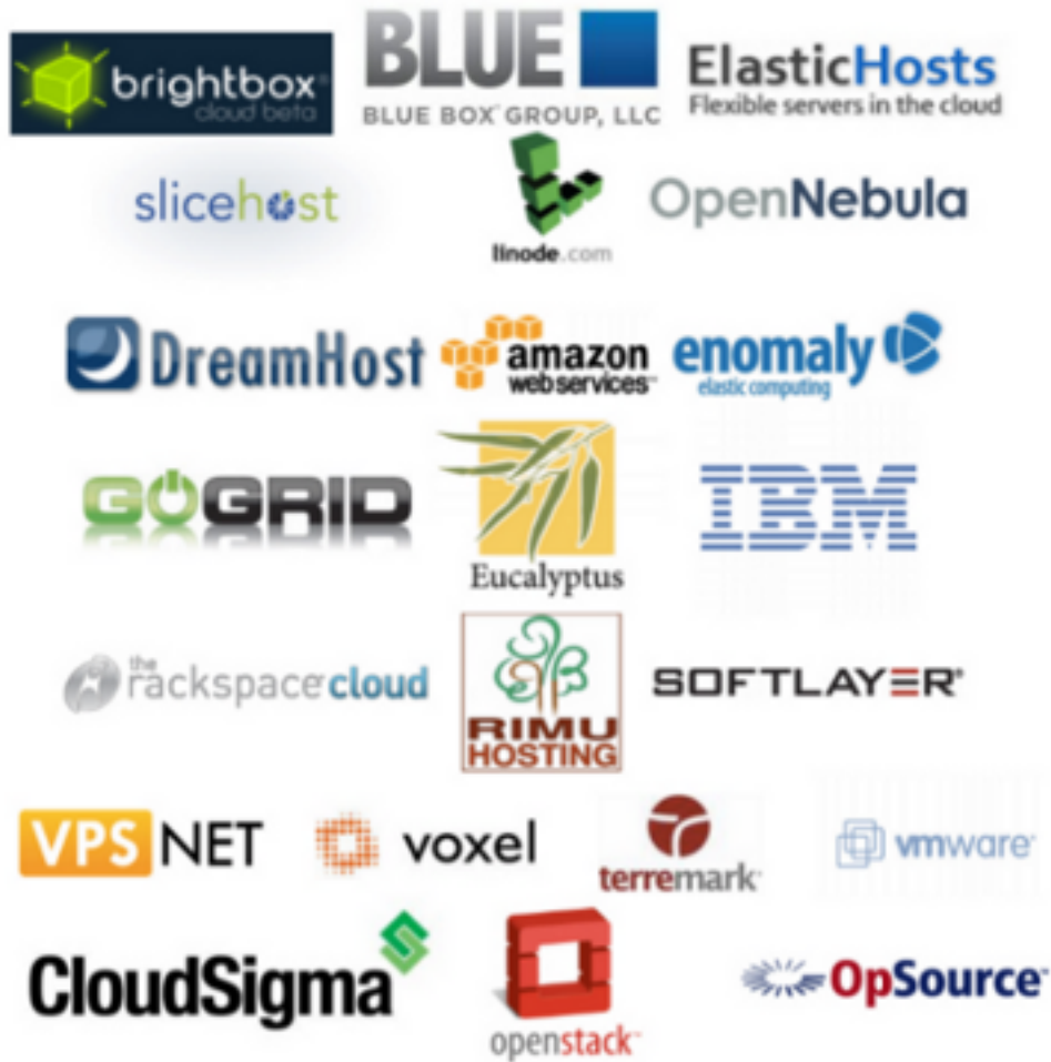
Fig. 1: A subset of supported providers in Libcloud.